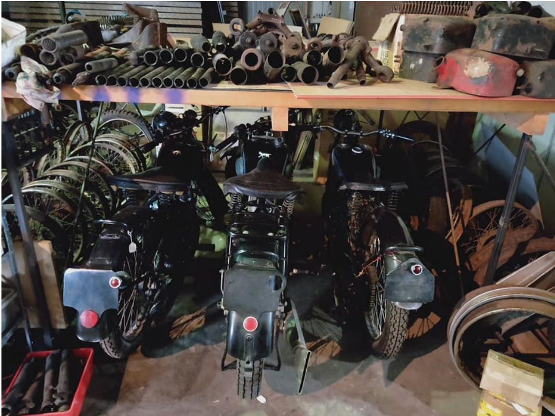
Complete bikes are not included in the job lot of parts